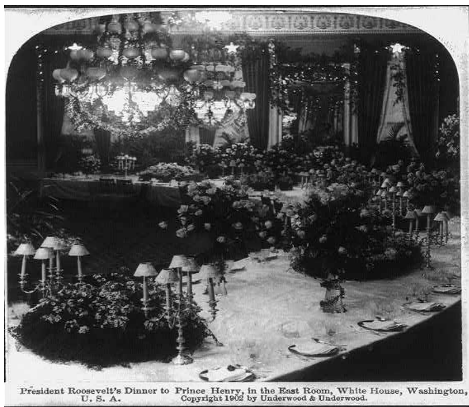
The East Room of the White House decorated for a State Dinner Honoring Prince Henry of Prussia.